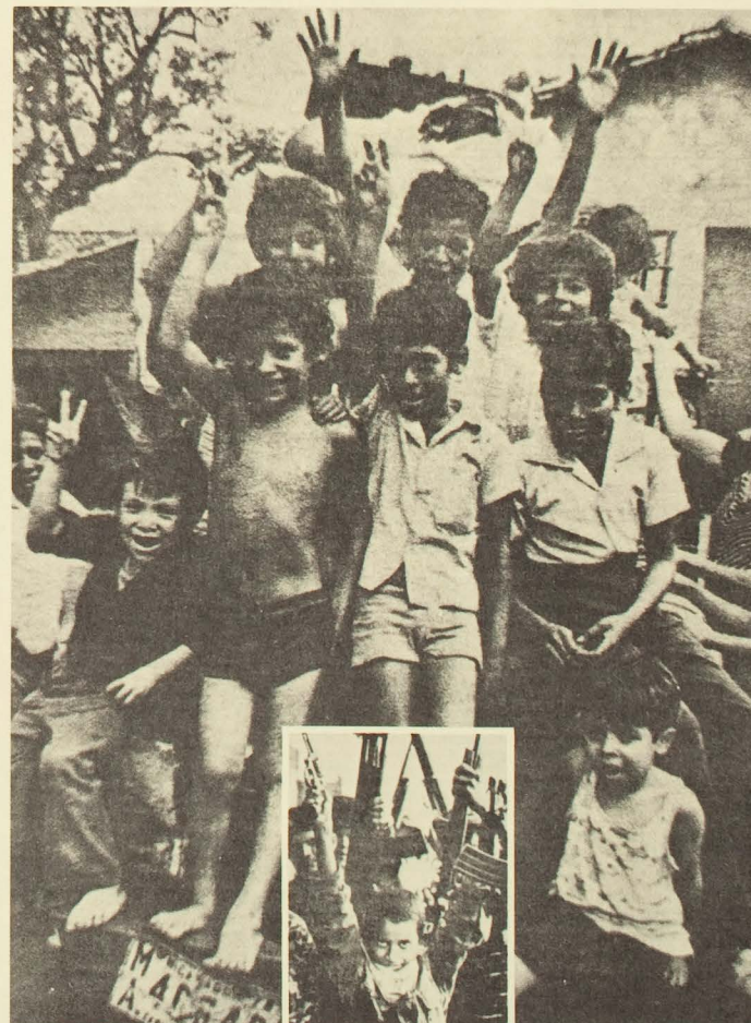
Nicaraguan children parade through the streets of Managua, overjoyed at the news that dictator Anastasio Somoza fled to Miami July 17.

The US Marines crushed rebellions in 1909, 1912, and 1926. The rebellion in 1926 led to a six-year guerrilla war by the Defending Army of National Sovereignty, led by Sandino, against 12,000 US Marines. Sandino was finally assassinated en route to a peace conference by the chief of the National Guard, Anastasio Somoza, on orders from the US Ambassador. Before the Marines left, they founded, trained,